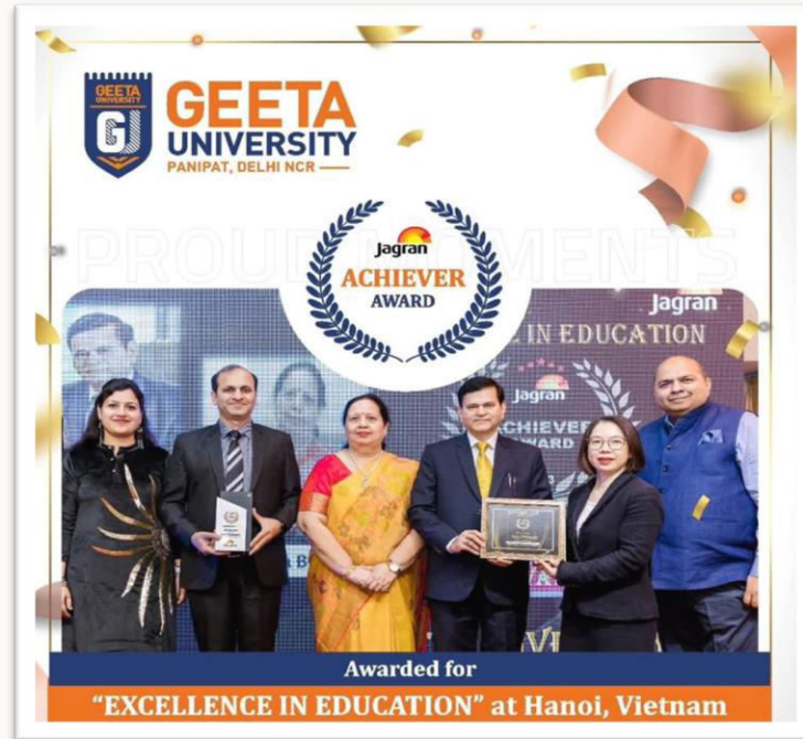
Awarded for “Excellence in Education” at Hanoi, Vietnam