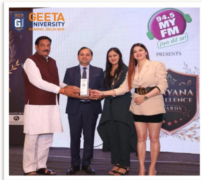
Awarded as Best University of the Region by 94.5 MY FM