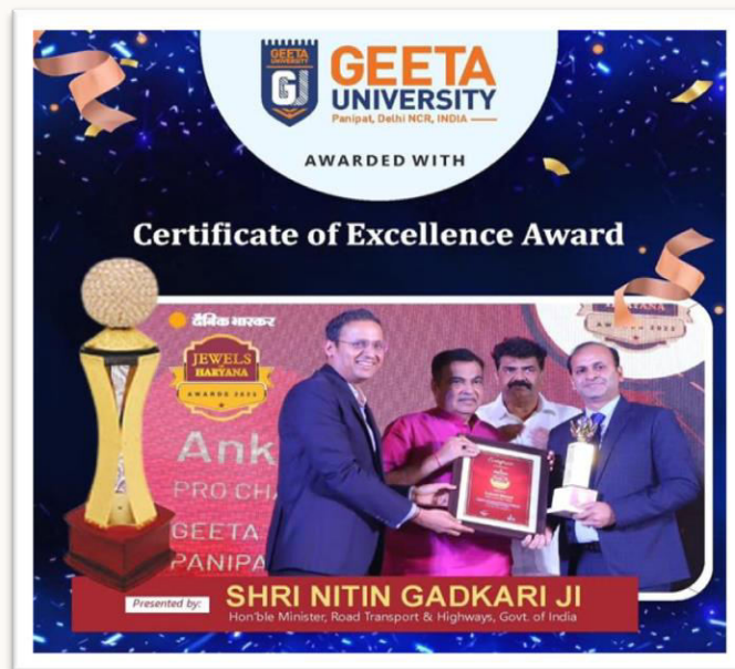
Certificate of Excellence Award Presented by Shri Nitin Gadkari Ji