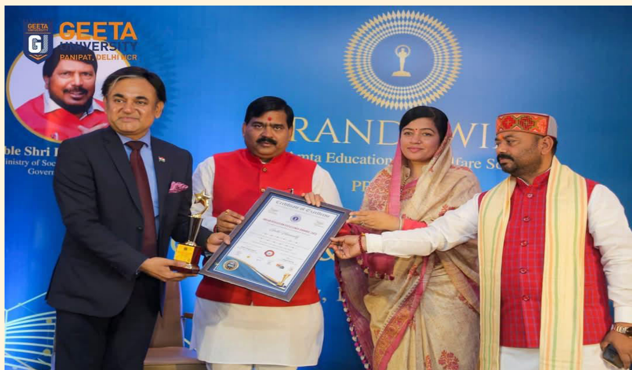
Awarded by Indian Education Excellence Award