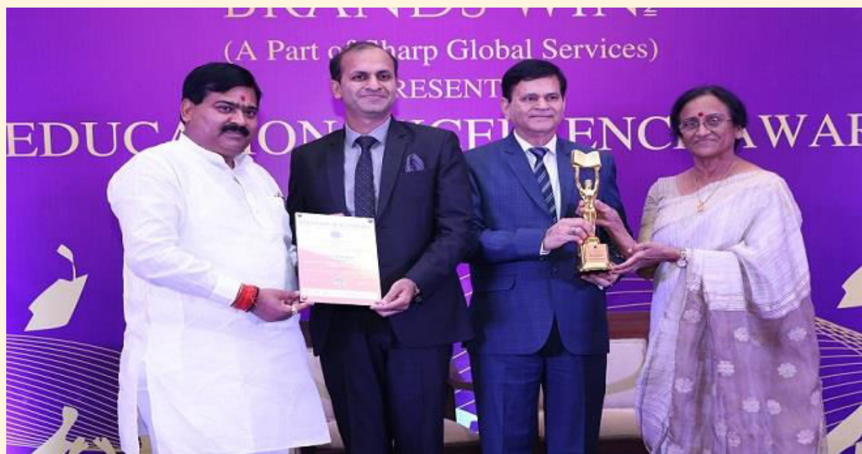
Awarded with Best Placement and Faculty Awards